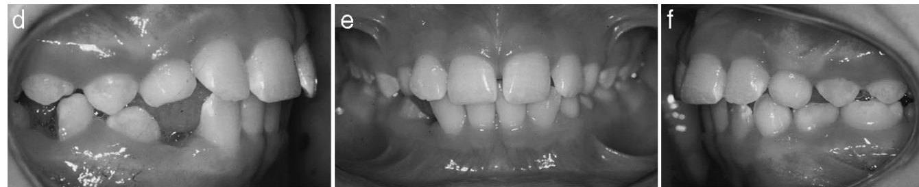
FIGURE 1. (d)–(f) Four months after unilateral hemisection. Note the midline still off 1–2 mm.

groups, all the cases treated by hemisection, but not having teeth removed in the maxilla and all the cases being treated by hemisection, but having teeth removed in the maxilla and a control. To establish what might represent a nontreated control, the Bolton templates from ages nine and 12 years were measured and included in the table in this study.