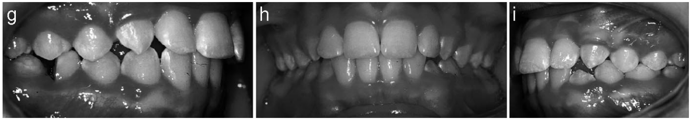
FIGURE 1. (g)–(i) Seventeen months after hemisection. Space is nearly closed and ready for removal of the mesial half; midline is still unchanged.